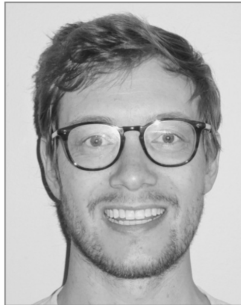
PETER C. RIGBY

“We list the reasons why our interviewees rejected a patch or required further modification before accepting it: Poor quality, Violation of style , Gratuitous changes mixed with ‘true’ changes, Code does not do or fix what it claims to or introduces new bugs, Fix conflicts with existing code, Use of incorrect API or library.”