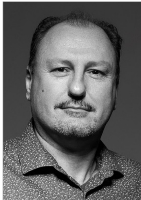
LIONEL C. BRIAND

“Our analysis suggests that mutants, when using carefully selected mutation operators and after removing equivalent mutants, can provide a good indication of the fault detection ability of a test suite.”